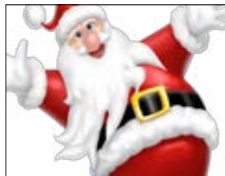
VILLAGE CHRISTMAS EVENTS Page 4