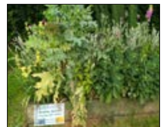
THE GREENER GOSCOTE PAGE Page 16