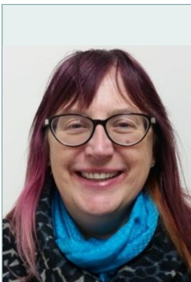
Cllr Jayne Stansfield, Mayor of Thornbury and Chair of Thornbury Town Council