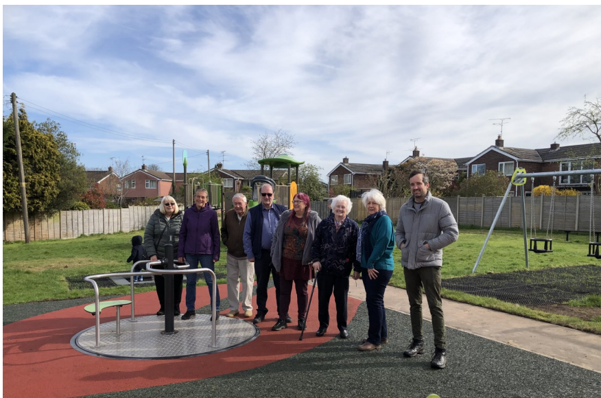
Councillors celebrate the opening of the newly installed Chantry Road play area.